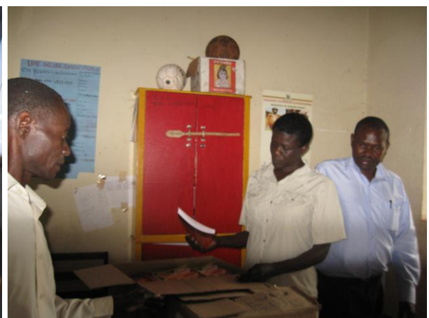
Deputy Headmaster and a